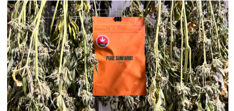
Grower-led 'Trials' program