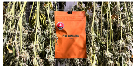
Grower-led 'Trials' program