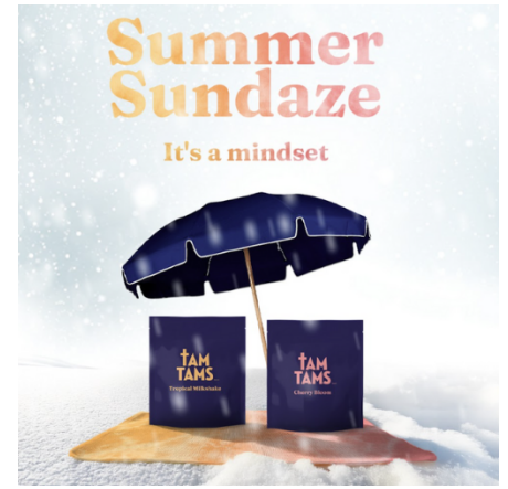
Cherry Bloom & Tropical Milkshake Pre-Rolls

https://www.globenewswire.com/NewsRoom/AttachmentNg/e33bb742-b46e-47a4-bc15-91c4ff2b6140