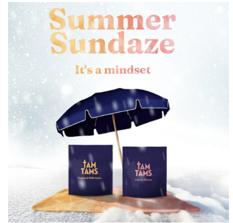
Cherry Bloom & Tropical Milkshake Pre-Rolls

https://www.globenewswire.com/NewsRoom/AttachmentNg/e33bb742-b46e-47a4-bc15-91c4ff2b6140