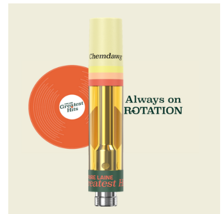
Greatest Hits Vape Cartridges